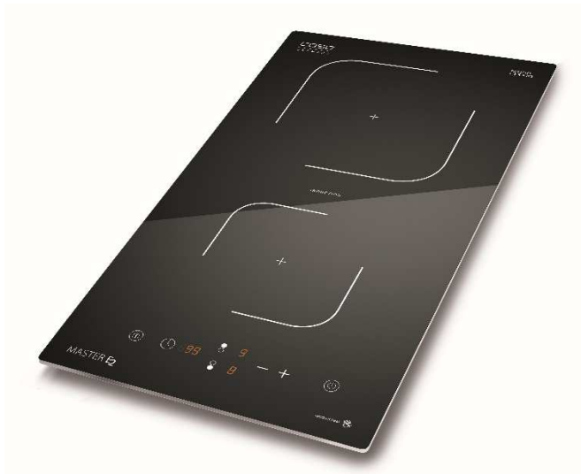
Master E2 induction