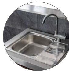
BUILT-IN SINK WITH FOLDING TAP