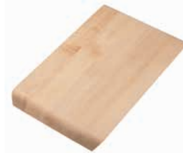
CUTTING BOARD - WOOD