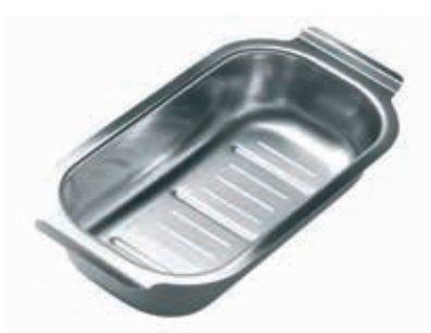
STRAINER INSERT FOR SINK