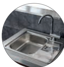
BUILT-IN SINK WITH FOLDING TAP